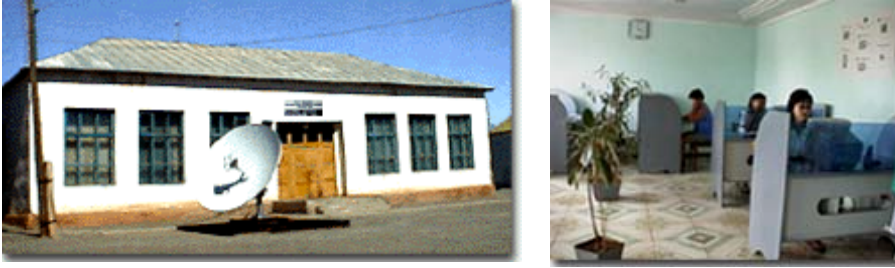
Figure 2. The public Internet center in the Gobi Desert

Poster (2001) in his book “What is the matter with the Internet” states that the Internet is a social space that has been continually changed and reappropriated by the users of it. The development of the Internet has been grown into different directions by opening new territories, new cultures, and new forms. Initially designed for the military purposes, the Internet has become a social space where multiple forms of commerce, virtual communities, and communications occur imploding the differences of space and time, and mind and body. He goes on to say that the Internet “opens new cultural and social worlds that are only beginning to be explored.” (p.37) Poster’s explanation of the Internet is directly used in this exploratory study, which examines how people in the rural area of the Gobi desert reappropriate the Internet in their local settings. The people in the Gobi desert do not necessarily use the Internet in the same way as the users in the developed and urbanized areas. This study strives to find out the social and cultural changes that are happening in the Gobi desert due to the Internet use and the differences and similarities between the use of the Internet by “have-nots” in the extreme remoteness and the users in the developed countries.